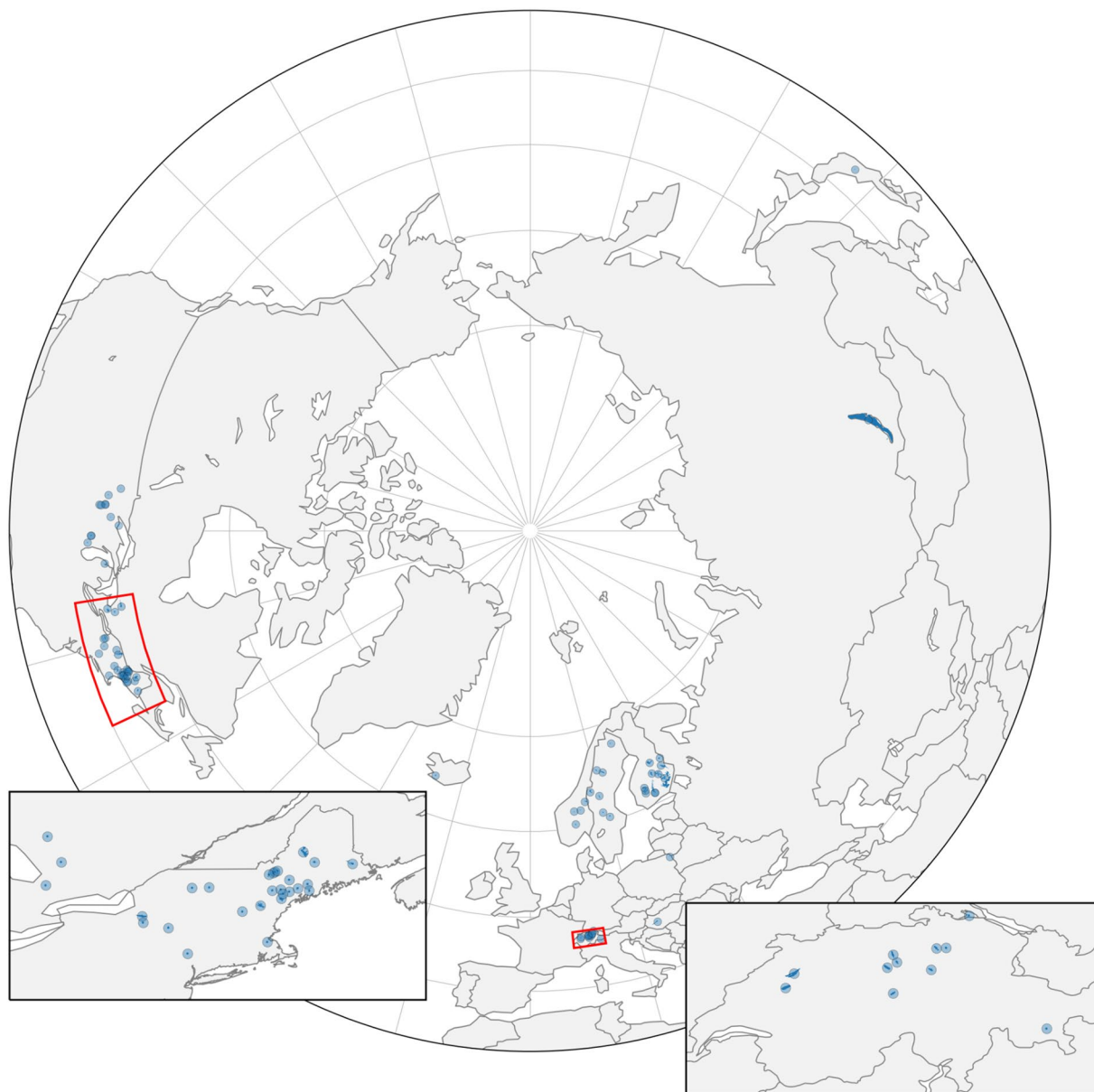
Fig. 1 Lakes with ice phenology data described in this dataset are outlined and filled in blue, using HydroLAKES polygons (Messenger et al. 44 ). A blue highlight is added to better identify the locations of even the smallest lakes. Insets show detail of the northeastern U.S. and Swiss lakes' positions.

Lake Auburn's ice phenology record began in 1863. The local power company and Auburn water district started the ice record and publicly shared ice-off dates when the winter ice disappears in the spring in local newspapers. All of the information was based on visual observations of multiple observers including Erica Kidd of Auburn Water District who reported the date in 2020. A comparison between two data sources (the state Bureau of Parks and Lands and USGS) with 5 overlapping years differ by \pm 1 day in most years.