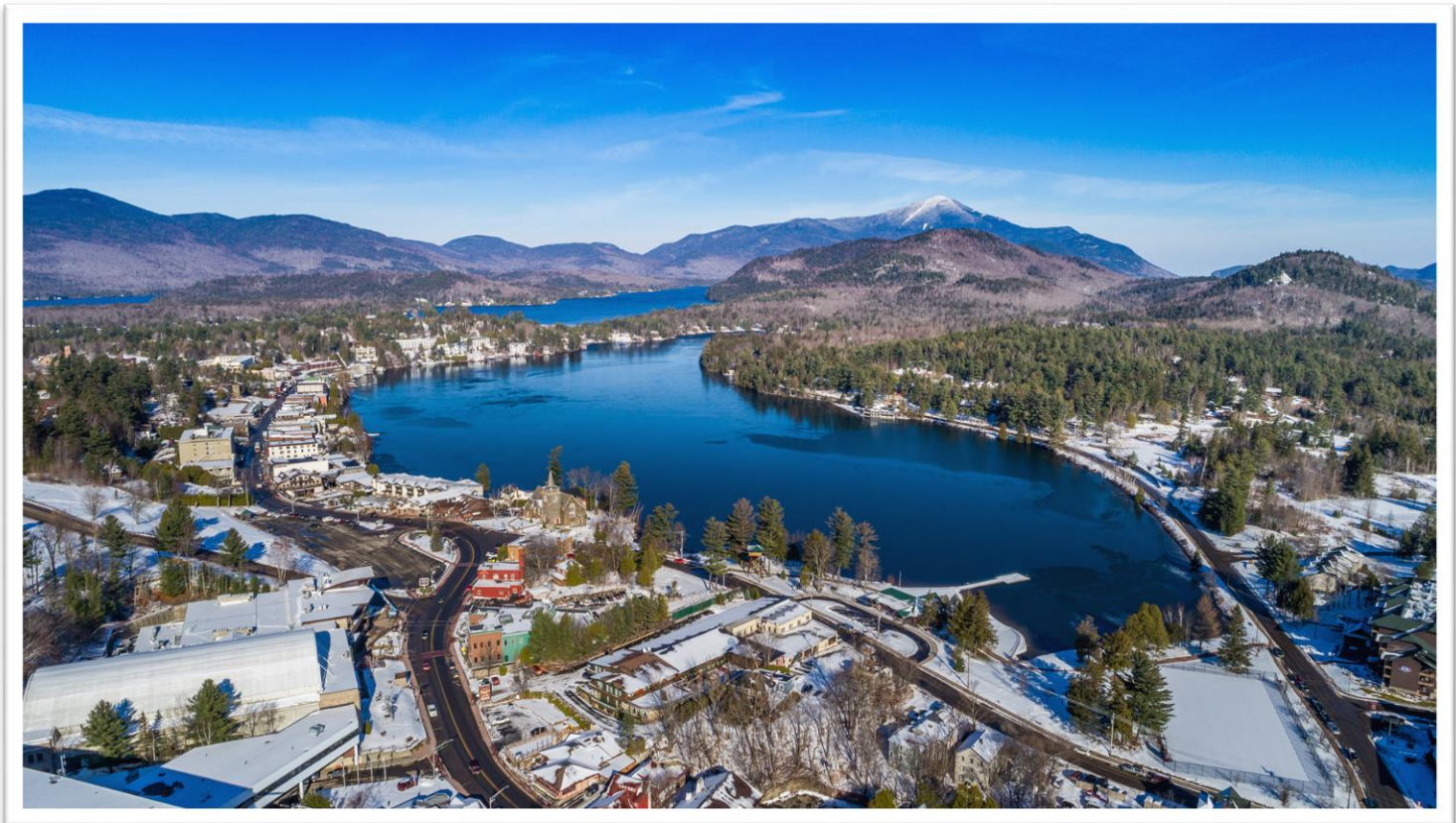
Aerial view of Mirror Lake