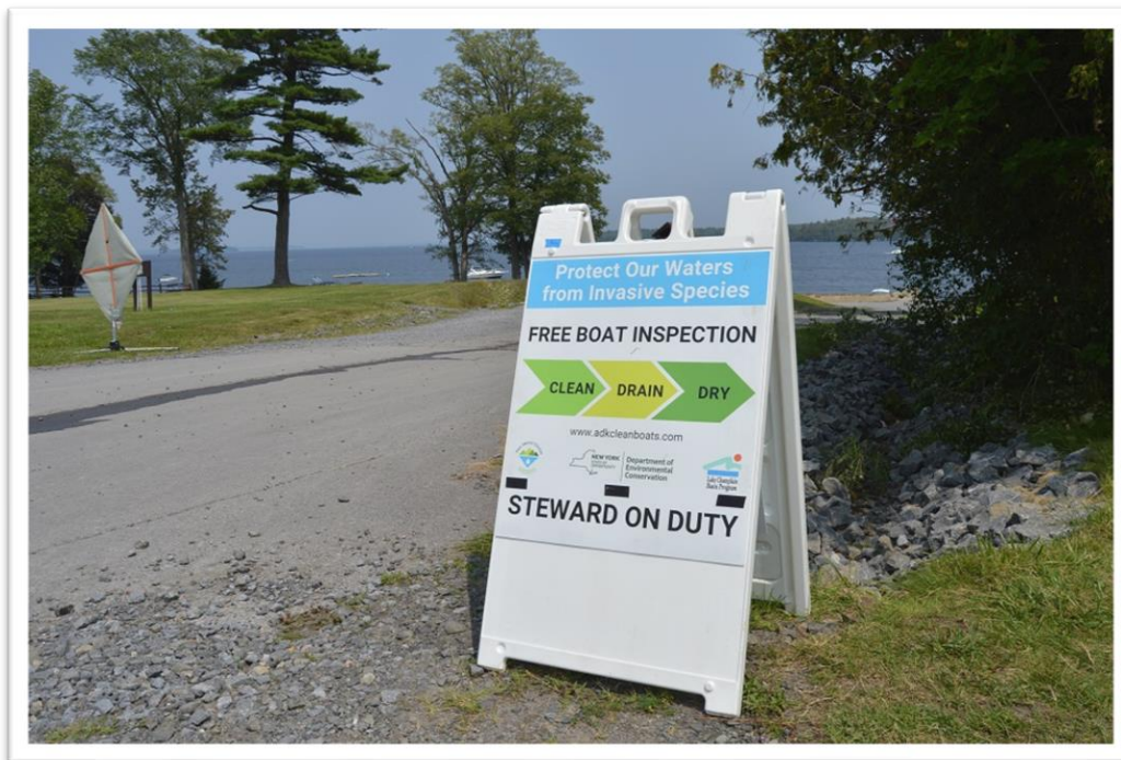
AWI steward sign at Lake Champlain, a nearby waterbody of concern for boats coming to Loon Lake.